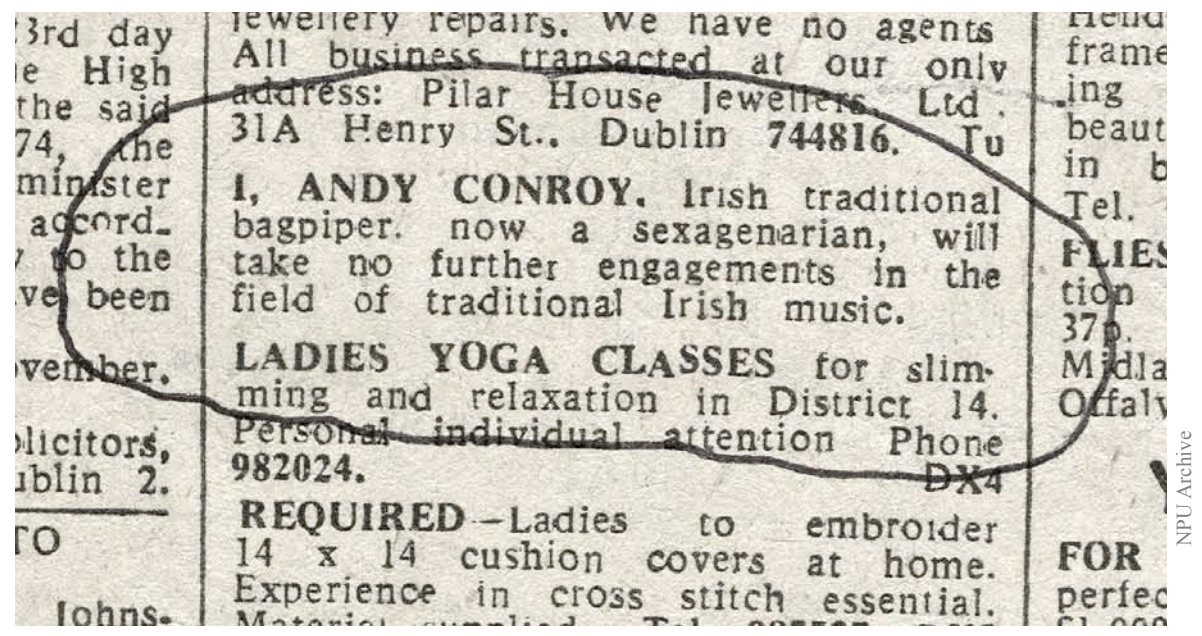
Like many of his actions, this was a ruse to confuse and ultimately to coax people to persuade him to play again, something he continued to do from time to time.